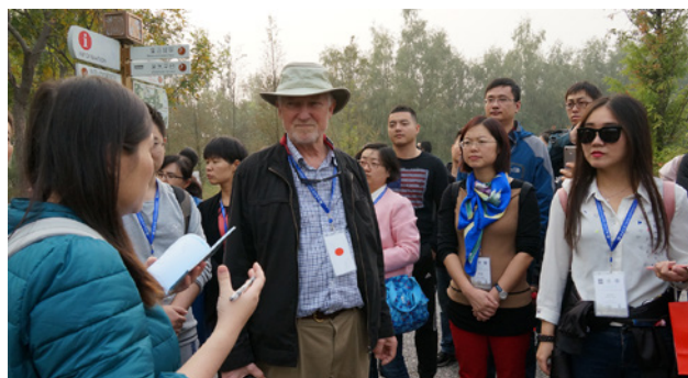
Wetlands field trip, Beijing, PRC TTT - October 2016