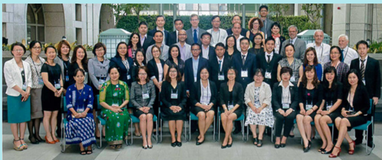
Second Manila TTT - June 2015